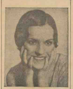
To all my listeners and friends The most Joyous and Happy New Year