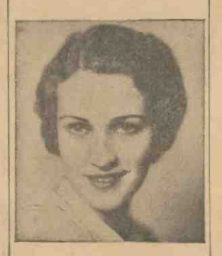
Let me sing your blues away in 1932.