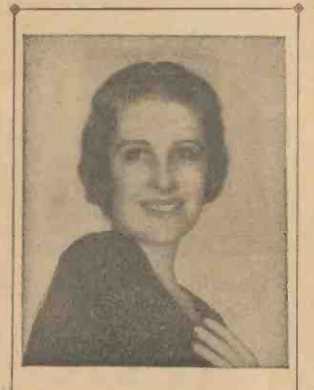
Sincerely hoping that 1932 will be all that your heart desires.