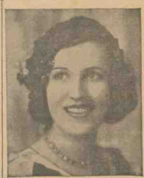
HAPPY NEW YEAR! Here's a wish for a gay new year As you can plainly see And here's the one it comes from "Little Me."

The "Charm in Personality" girl also "Sherwin Williams-Program"