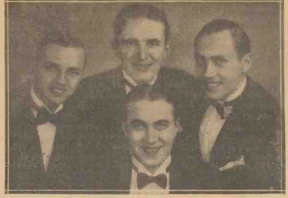
The Four Kings of Harmony, who entertain listeners from WGN every Monday and Thursday afternoon at 4:00 p. m.