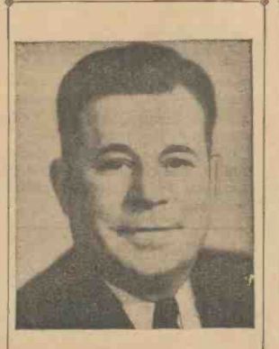
Ol' Pappy and little Booker-Cephus hope dat yo'll will pleadsure yousefs dis Happy New Year!