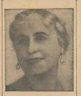
May the New Year be one of Joy and Happiness is the sincere wish of