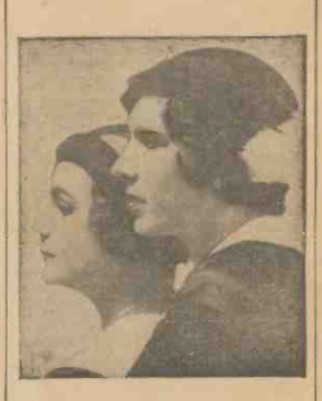
Yours for "Joyous Adventures" for 1932